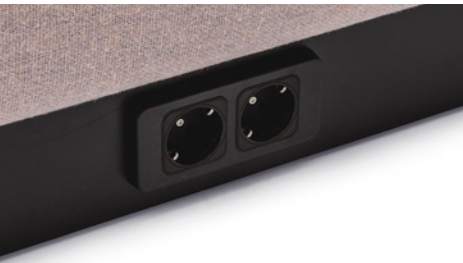
Power sockets in base